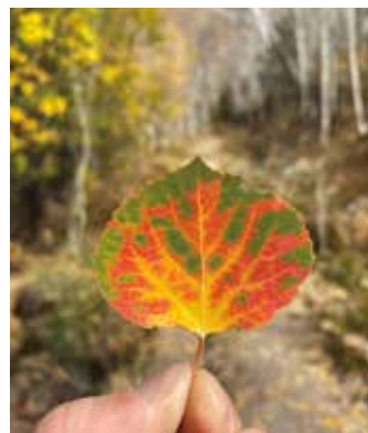
Untitled –Jared Wise