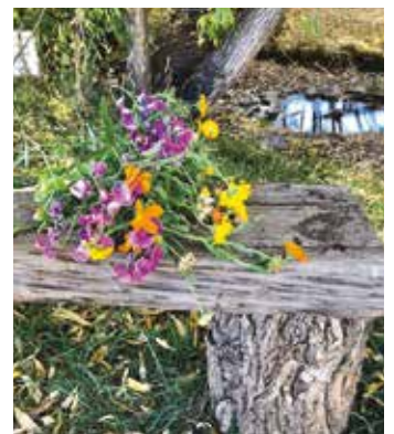
The Last Call of Fall –Norwood Community Garden