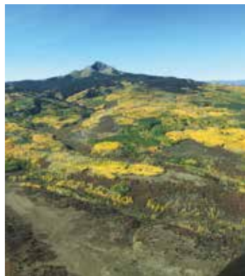
Fall Photo at 10,700 ft. High North of Lone Cone

View all submissions and prize winners and the video exhibition at www.smpa.com/content/fall-colors-photo-exhibition... to our leaf peepers, and to all members of San Miguel Power. You're what it's all about.