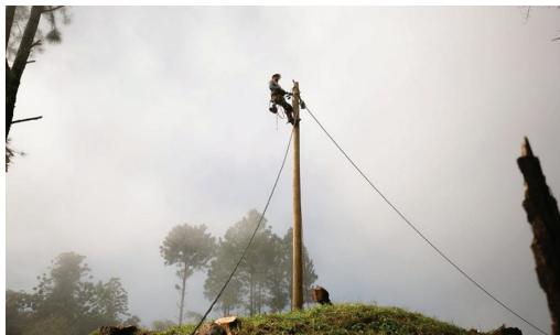
KJ in position atop the pole that would send the power line down the mountain side to Sillab. Crews had just hung the first transformer and were getting ready to pull the wire to raise it into position. "Right where you see me there," remarked Johnson, "...is one of the most beautiful places that I have ever been."