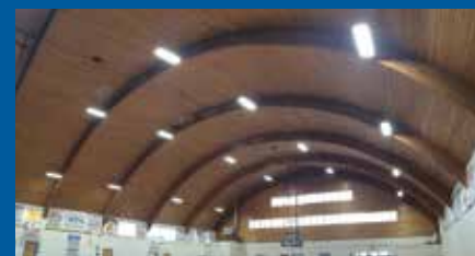
These energy-saving LED lights compliment the Naturita Elementary School Gymnasium's unique arched wooden ceiling.

—MIKE EPRIGHT, WEST END PUBLIC SCHOOLS SUPERINTENDENT