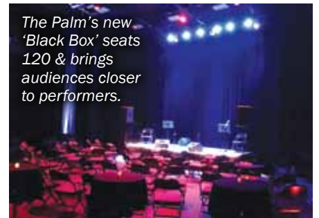
The Palm's new 'Black Box' seats 120 & brings audiences closer to performers.

Learn more at www.telluride.com/michael-d-palm-theatre