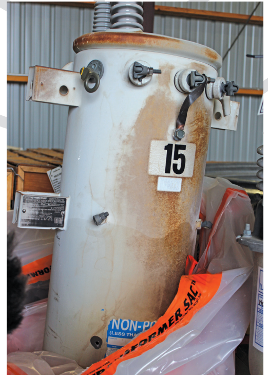
An example of a 15KVA distribution transformer that has been shot and damaged beyond repair.

and unwarranted costs. Power outages are inconvenient, but they can be the least serious consequence of vandalism. Our mem-