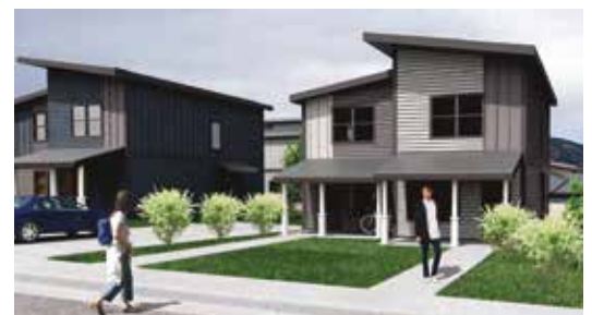
Affordable housing projects in Ouray and the West End of Montrose County benefitted from last year's Sharing Success Grants.