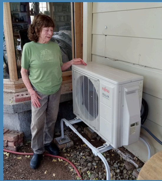
CARE participant with new cold climate air source heat pump

THINKING, AND VISIONARY. It is designed to amplify community impact by doubling and tripling its contribution to initiatives through leveraged state and federal funding. For example, the match funds provided by the Green Fund have enabled microgrid planning and construction grants to be awarded to SMPA. This state grant funding from DOLA, in collaboration with the Green Fund, makes it possible to build innovative renewable energy infrastructure. Microgrid projects are just one example, along with SMPA rebates, the income-qualified weatherization program (CARE), and local renewable energy projects like the Paradox and Last Dollar solar projects and Coal Creek Micro Hydro. You'd be hard-pressed to find another rural utility cooperative in Colorado leading in the same way SMPA is with the Green Fund. It's a visionary model that works for all of us, no matter where we live in the region.