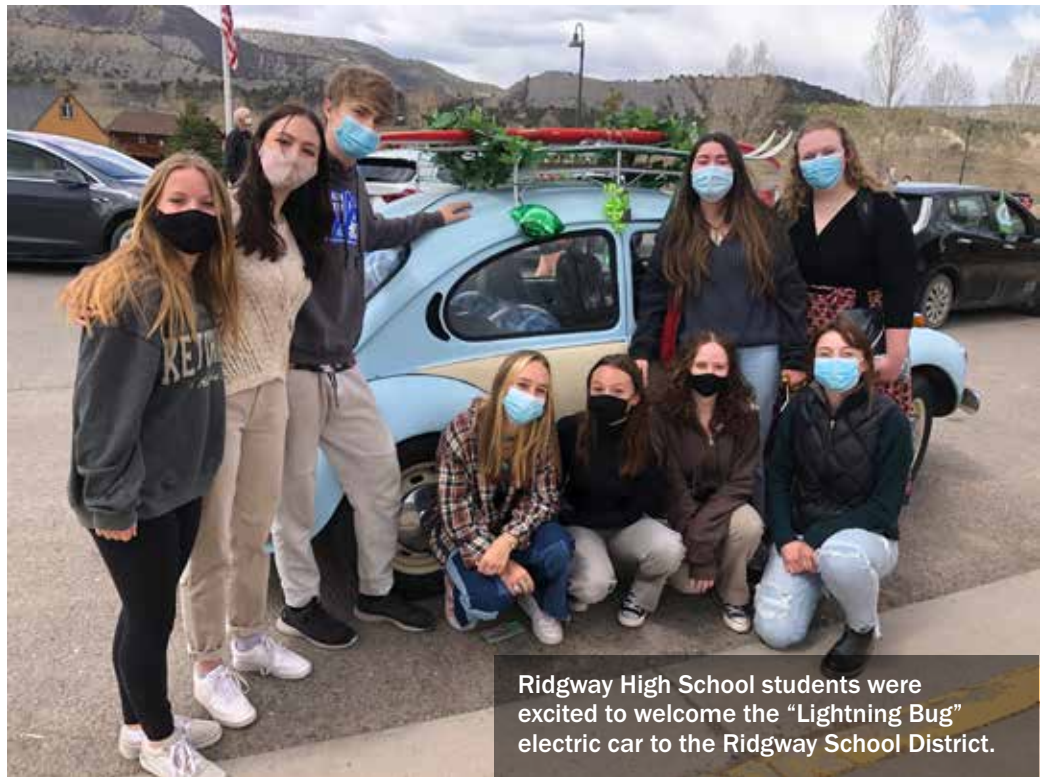
Ridgway High School students were excited to welcome the "Lightning Bug" electric car to the Ridgway School District.

If the Earth had a soft spot, it would have been at the Ridgway Secondary School at the Earth Day Celebration, last month. At this event, the Secondary School students joined local governments, businesses, community organizations and electric cooperatives, San Miguel Power Association (SMPA) and Tri-State Generation and Transmission (Tri-State) to show their commitment to improving the environment.