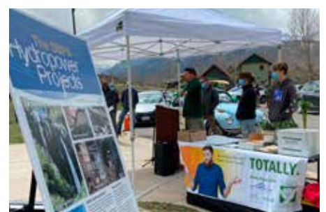
SMPA's Totally Green program and Beneficial Electrification Rebates were on display at the Earth Day event.