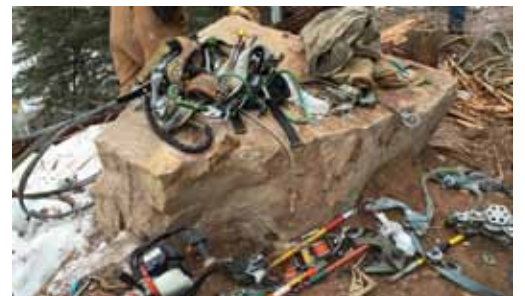
Last year, this rock tumbled from the canyon wall, approximately 800 feet above, striking a power pole. Power to most of the Telluride area, including parts of Mountain Village and outlying communities was out for nearly 24 hours.