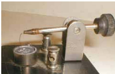
Invented in 1904, the so-called cat's whisker detector was used to rectify the radio signal of crystal radios in the early twentieth century. It was one of the first electronic semiconductor devices ever made.